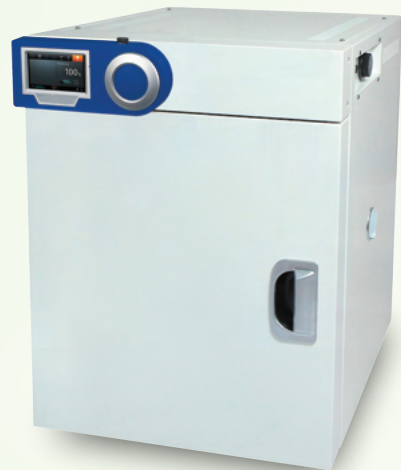
Incubator & BOD