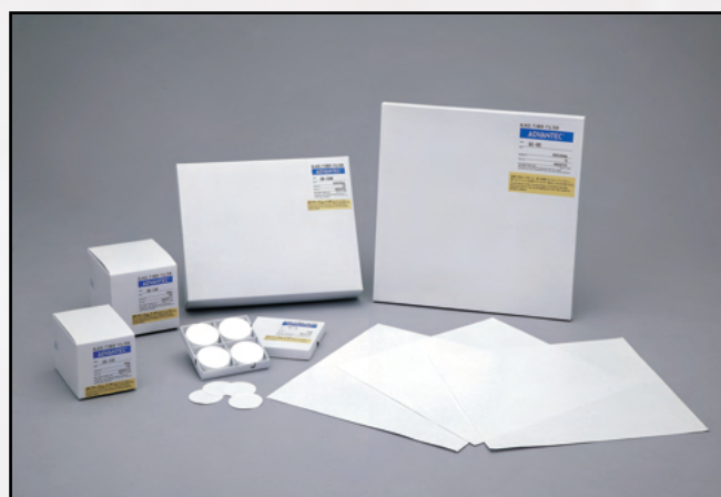
Glass Fibre Filters