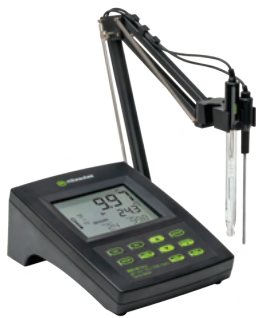
Benchtop Meters - pH/ Temp/ ORP/ TDS/ EC/ ISE/ NaCl/ mV