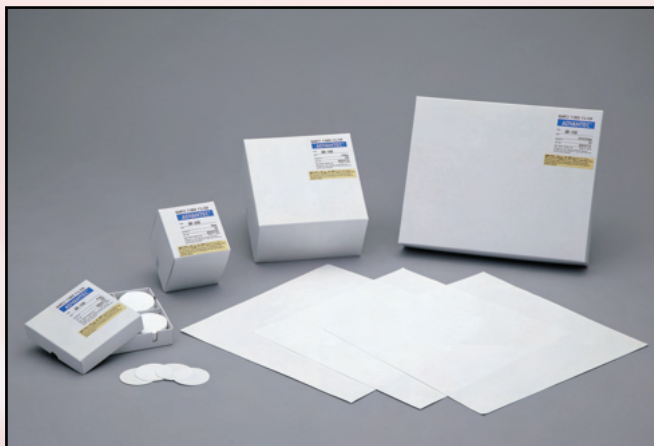
Quartz Fiber Filters