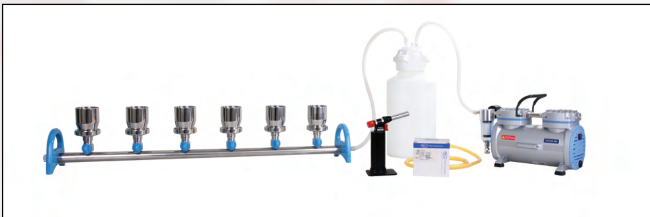
Manifold Sets with Vacuum Pump