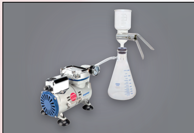
Vacuum Filtration Assembly