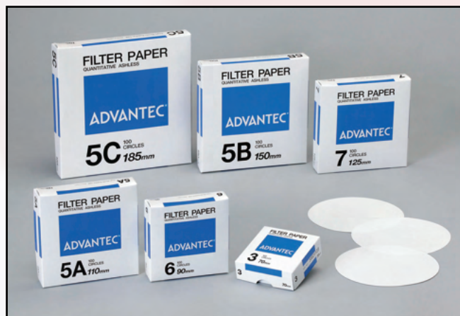
Quantitative Filter Papers