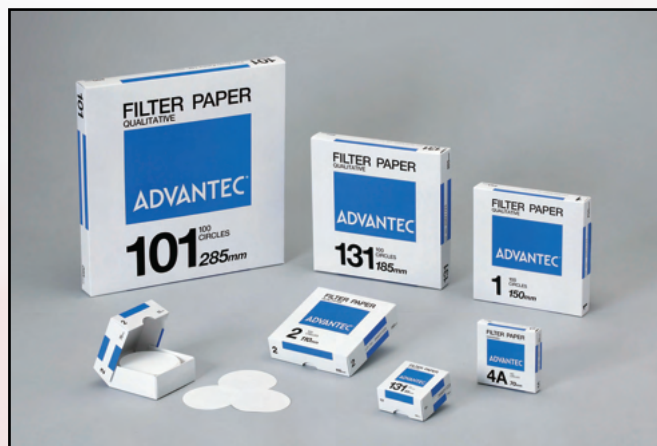
Qualitative Filter Papers