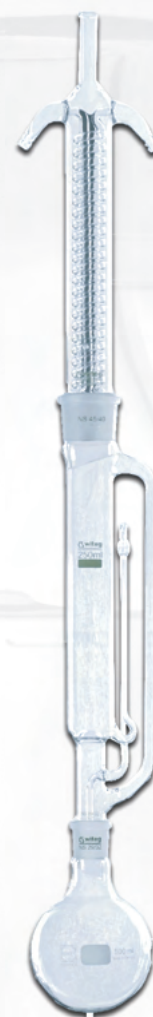
Dean & Stark Apparatus