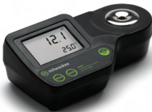
Refractometers - Brix/ Fructose