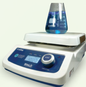
Hotplates & Stirrers