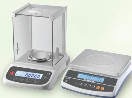
Analytical & Precision Balances