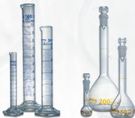
Graduated cylinders & Volumetric flasks